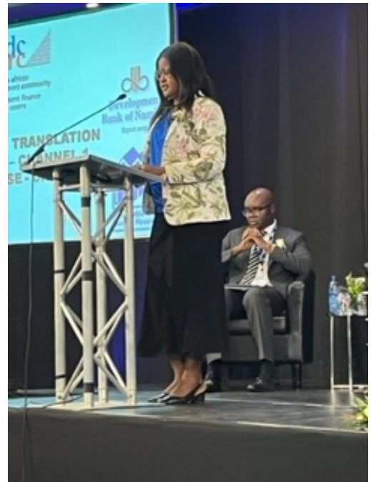
Delegates at the CEO's Forum in Swakopmund, Namibia