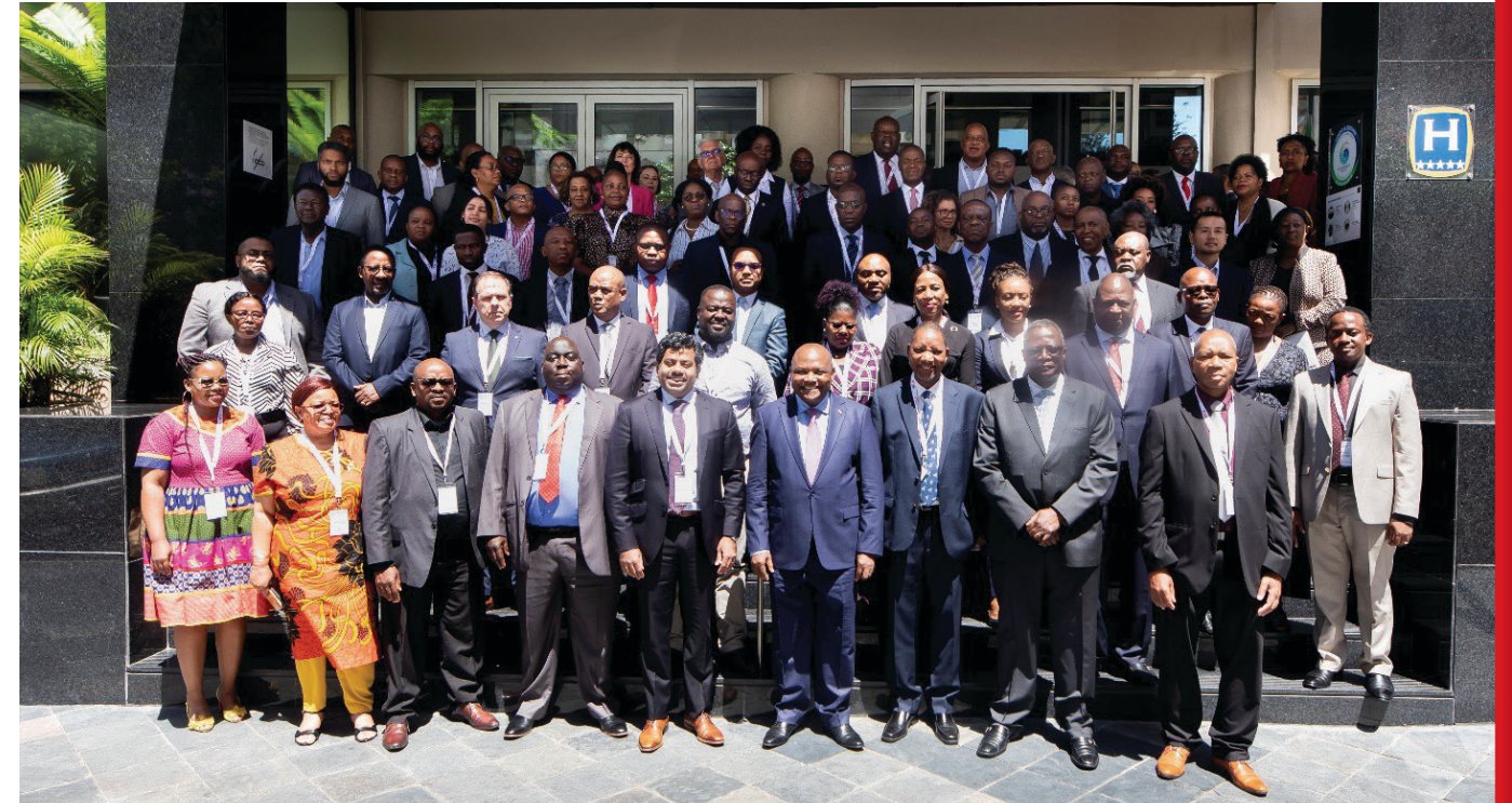
SADC DFI CEOs forum in Maputo, Mozambique