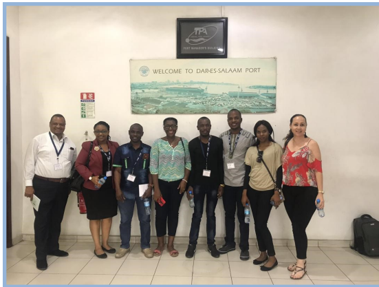
Participants at the Structured Trade Finance programme

The programme attracted twenty-eight participants.