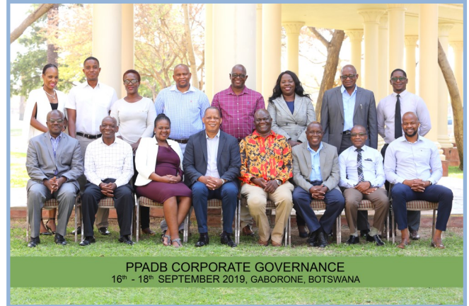
Participants at the Corporate Governance programme

The programme also provided the opportunity for serving directors to improve their skills in the boardroom through a practical and interactive approach that involves case studies, group work and discussions.