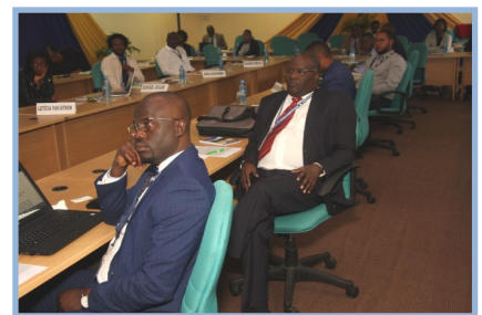
Participants at some of DFRC programmes

Programmes for financial year 2019/20 can be viewed by following the links below: