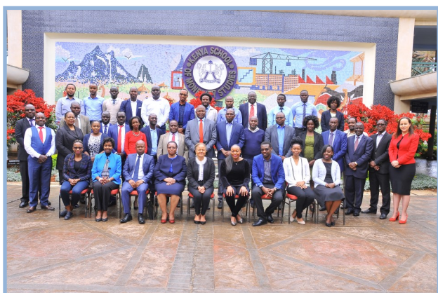
Participants at the Enterprise Risk Management programme

The programme was attended by forty-four (44) participants.