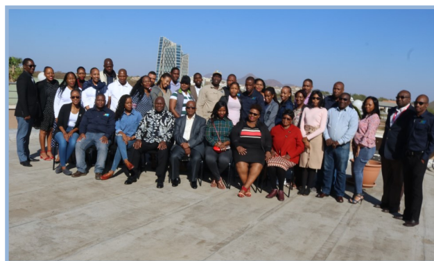
Participants at the Credit Risk Management programme

Thirty-one (31) participants attended the programme.